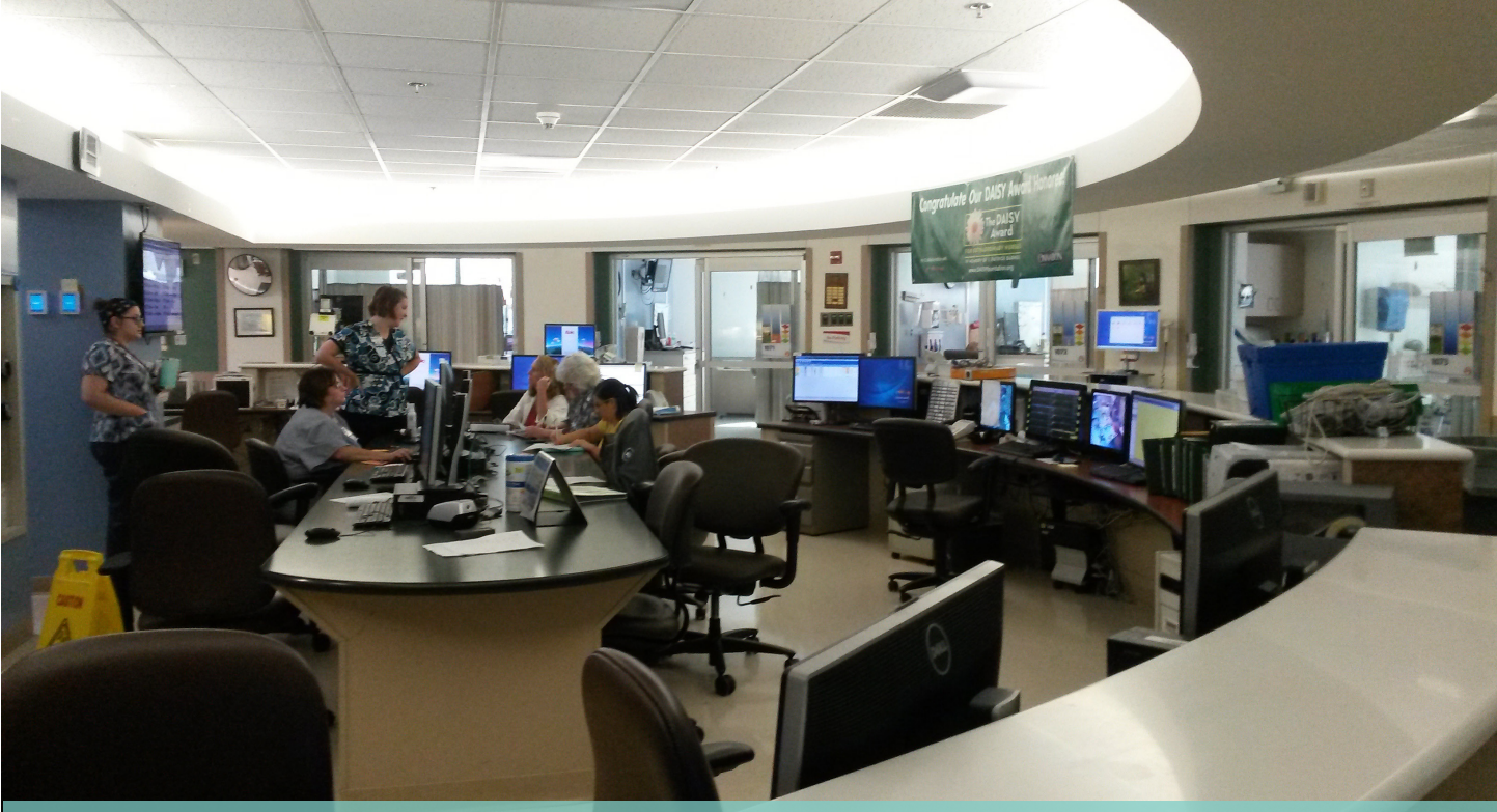
Intensive Care Unit floor at Carilion Roanoke Memorial Hospital. The team from Virginia Tech and Steelcase observed and interviewed clinicians at work.

Environments such as ICAT, whose mission is to reach across the departmental or hierarchical boundaries of colleges and institutions, are invaluable because of their ability to provide the right blend of expertise and perspective to identify and then solve problems for partners.